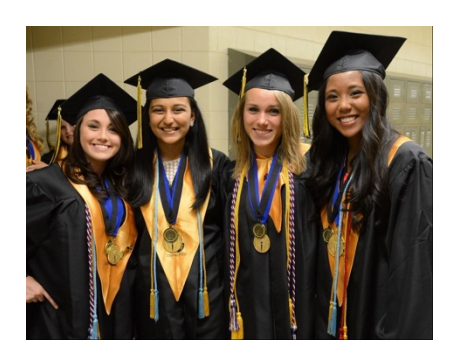
April 11 - Graduation Announcements delivered from Jostens in the Cafeteria during lunches

April 14 - Exit with Pride in Auditorium during Panther Hour (9:09 a.m. – 9:49 a.m.)